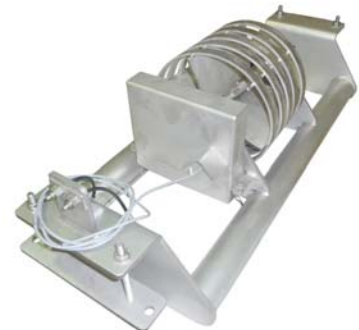
Stainless Steel Spiral pulley shown with the proximity switch.