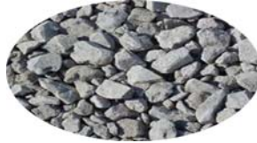
Aggregate, cement and building materials processing