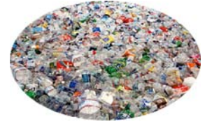
Recycled material processing

Web Tech AutoWeigh is a privately owned Australian company specialising in the design, manufacture and servicing of continuous weighing and feeding equipment for all facets of industry. Established in 1984, our head office and manufacturing facilities are located on the Technology Park at Eight Mile Plains, just south of Brisbane CBD, Queensland.