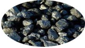
Mining and mineral processing